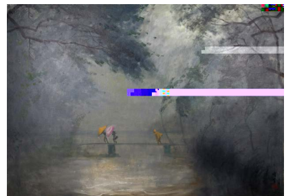
140x 100cm 1997